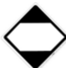
Limited Quantity Ground